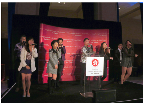
BoonFaySau a cappella