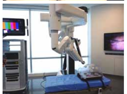
da Vinci surgical robot in action